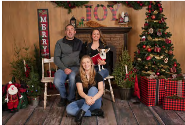
A photo from 2023's Santa Paws set. Stay tuned to our website and Facebook page for details about 2024's set—we're sure you'll all love it!

with Red Poppy Photography, and longtime photographer Dave Schwarz. Because of them and all the volunteer who help us put