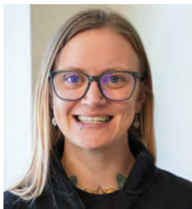
By Rose Hegerle, CVT

In 2024, Tri-County Humane Society took in 5,160 animals. Of those animals, 964 went into our foster program – that's almost 1 in 5 animals. Our foster program is instrumental in helping more shelter animals receive the love and care needed prior to adoption.