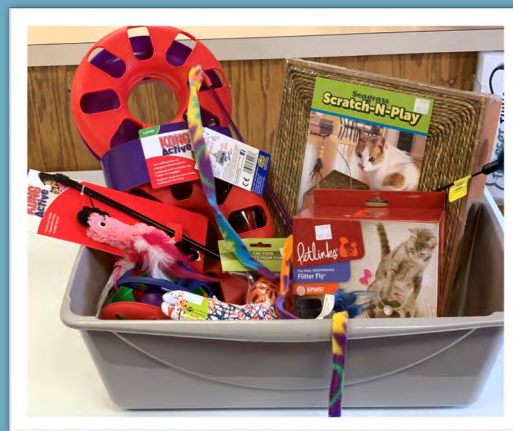
A selection of cat toys available at our Re-Tail Shoppe!

And the best part – all the profits go back to the animals.