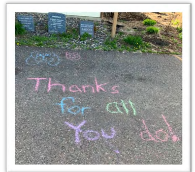
A supporter left this message