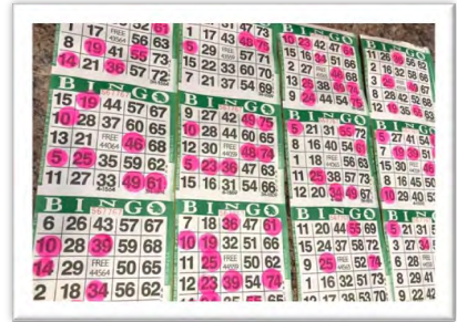
Pooch Purse Bingo!