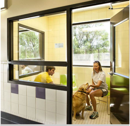
Pets and people will get to know each other in one of two "get acquainted" rooms before they go home.