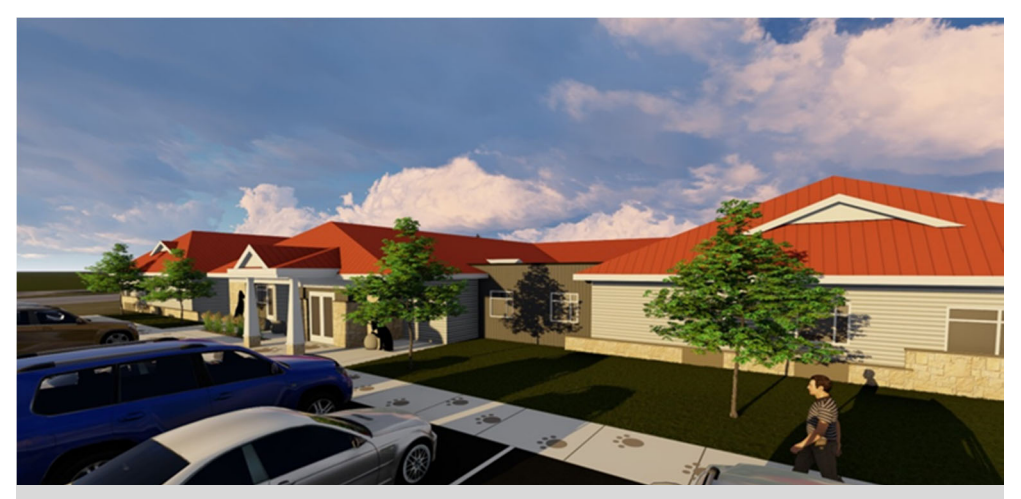
Exterior of proposed shelter.