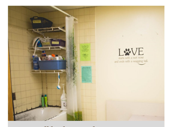
The small bathing and grooming room does double duty. It's also the only inside place for families to interact with animals outside their cage.

Our current shelter—hobbled, patched, repaired, stretched—houses as many as 140 animals, 30 caregivers, and dozens of people who come here to add to their families. All at one time! Crowded? Encumbered? Yes, very.