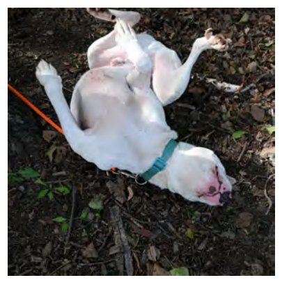
Having really cute animal pictures to put on social media really helps, too!

With COVID, TCHS hasn't been as active in some community events as we have been in the past. Luckily, to counter that, our online presence is still strong, with robust engagement and follower numbers.