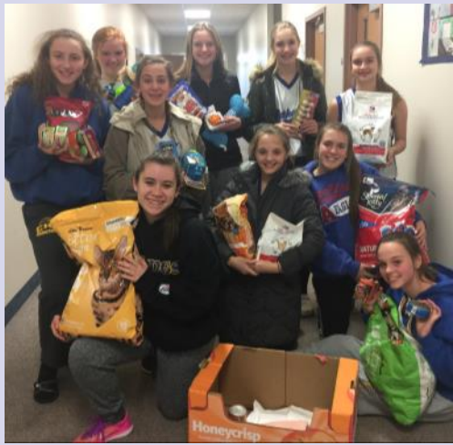
Cathedral 8th Grade Girls' Basketball Team , for their pet supply drive!