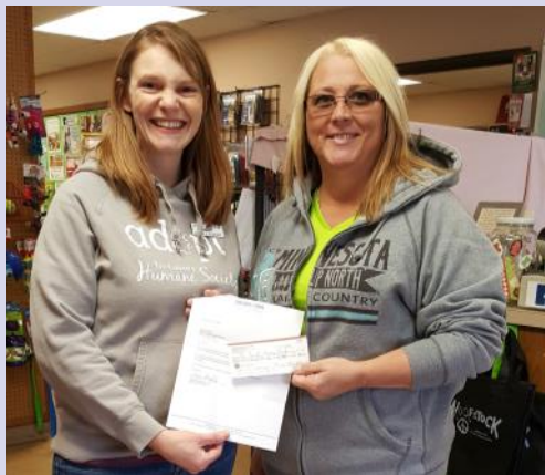
Knotty Paws Grooming and Salon & Spa Professional Association, Inc. , for hosting a Spas for Paws Pub Crawl Downtown that raised $613!